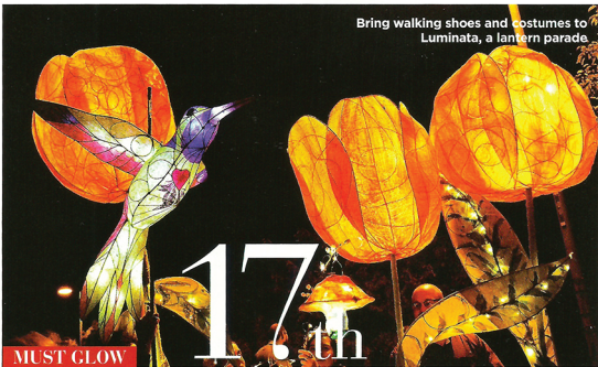
Bring walking shoes and costumes to Luminata, a lantern parade

9/11 Loosen those hips and bring your appetite for this fun festival, where you can experience the sights, sounds and tastes of the islands. Enjoy traditional dance and music, then join the fun with hula, ukulele and slack-key guitar workshops. There's also the chance to sample authentic Hawaiian food, including poke, shave ice and—for the ambitious—a musubi-eating contest. 11 a.m.–7 p.m. Free. Seattle Center, Armory area, 305 Harrison St.; seattlelivealohafestival.com